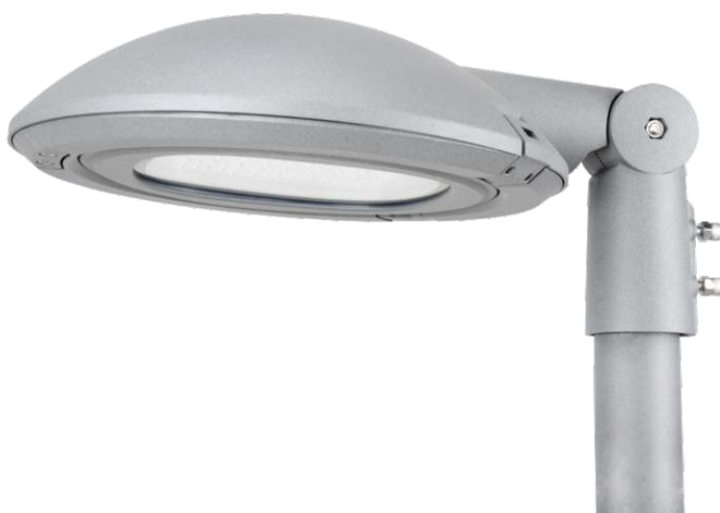
A5 LED Street N Series